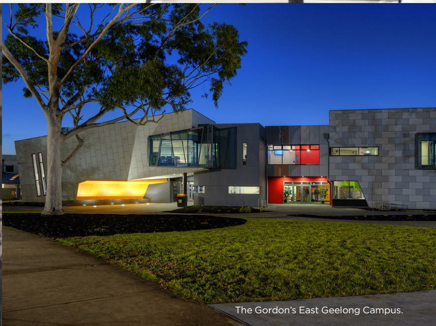
The Gordon's East Geelong Campus.