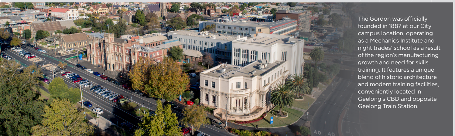
The Gordon was officially founded in 1887 at our City campus location, operating as a Mechanics Institute and night trades' school as a result of the region's manufacturing growth and need for skills training. It features a unique blend of historic architecture and modern training facilities, conveniently located in Geelong's CBD and opposite Geelong Train Station.

The Gordon has two major campuses in Geelong, a port city located on Corio Bay and the Barwon River, in the state of Victoria. Located 75 km south-west of Melbourne, it is the second-largest Victorian city with an estimated urban population of 268,277 (as of June 2018) and is Australia's second fastest-growing city. The Gordon has also expanded into the growing Wyndham region (Werribee and Hoppers Crossing campuses), which presents a set of specific needs, including rapid population growth, increasing educational attainment, a socially diverse population, and a changing economy and industries.