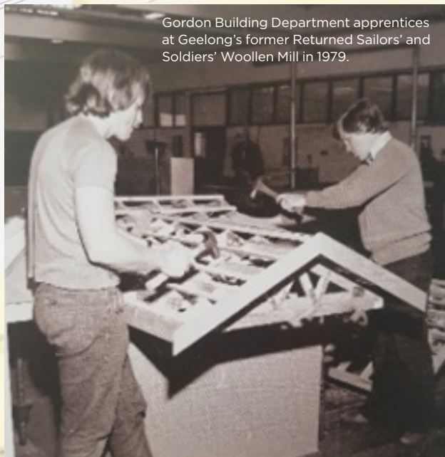
Gordon Building Department apprentices at Geelong's former Returned Sailors' and Soldiers' Woollen Mill in 1979.

The COVID-19 pandemic will have a substantial negative impact on labour market activity in the region over the coming months - and potentially instigate a significant structural adjustment. At the time of writing, however, there is considerable uncertainty around the economic implications of the virus and the magnitude of the changes to employment that will result. The following represents an overview of the sector as The Gordon understands it coming into the pandemic period.